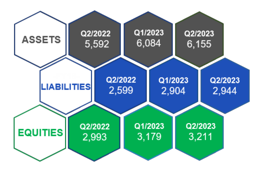
Figure 3: Comparison of Statements of Financial Position (Quarterly)

The reasons for the change from the consolidated statement of financial position are as follows.